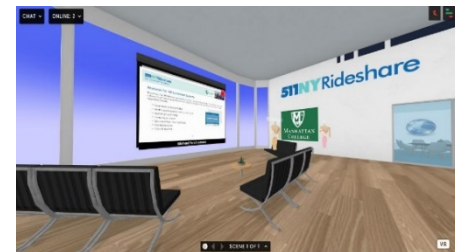
Virtual reality event with Manhattan College, October 2020

Pandemic Response: 511NY Rideshare program pivoted to virtual events and meetings. The program hosted two peer roundtables in Spring 2020 with a range of organizations to share experiences related to alternative schedules, telework practices, returning to work, and biking. The program’s mobility kiosk provided a safe outreach alternative with an antimicrobial screen and built-in hand sanitizing station. The kiosk was hosted for several weeks at Forest Hills and Woodhull hospitals. Additionally, the program enhanced online events offerings with an interactive virtual reality platform to boost participant engagement. The program saw self-registrations grow over 300% in Spring 2020 from hospital workers looking for safe commute alternatives to transit.