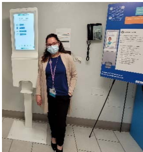
Mobility kiosk at Forest Hills Hospital, November 2020

Partnerships: In response to the biking boom in NYC, with bike count data up 30-40% compared to 2019, the 511NY Rideshare program partnered with NYCDOT and Bike NY to deliver over 20 virtual events focused on bicycle resources and safety, distributing 400 free bicycle helmets to attendees. Program staff engaged with business improvement districts (BIDs) to better serve small businesses and began outreach to social & human services organizations like NY Cares to advance transportation equity in the region.